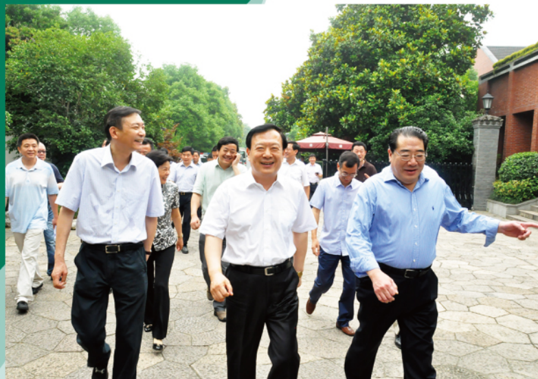
2014年6月，省委书记夏宝龙调研园区 June 2014, the provincial party secretary Xia Baolong research park

Holding the concept of creating "the financial centre at the south of the Yangtze River Delta", Hangzhou government plans Hangzhou wealth management center for the long run, especially the construction and development of the Fund Town at the south of Yuhuang Mountain by referring the developing experience of the shaping financial centre cities of important influence at home and abroad and the domestic agglomeration areas of finance industry, and gives this project the most preferential policies and comprehensive matching support.